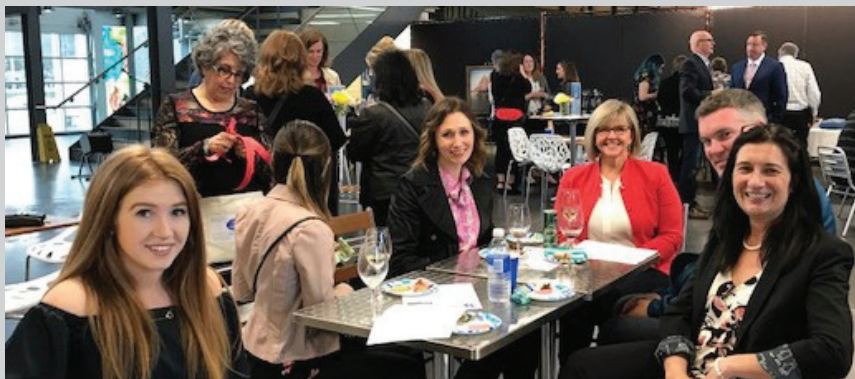
Mission friends from Logistec enjoying a Toast to Spring.