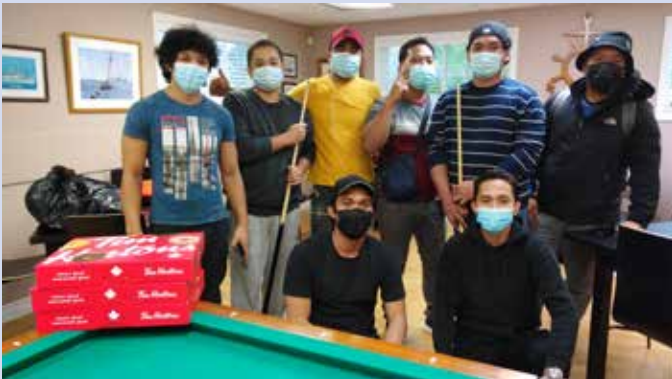
Augusta Luna Crew after 3rd wave

Celebrated on June 25th , the focus was on seafarers acknowledging the essential role they play in keeping the global economy afloat. They do so to support their families and in doing so face great challenges. Visiting seafarers love DONUT DELIVERIES . This is a small gesture of thanks from our Mission staff, volunteers and friends within the Canada-Philippine community, who pay for and delivered donuts to crew members.