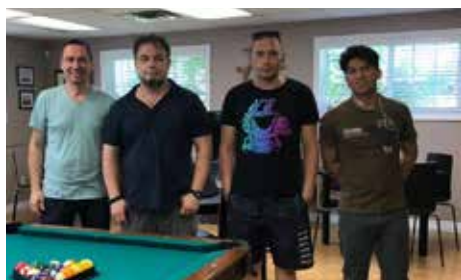
Maersk Palermo CAPTAIN & CREW

especially during pandemic lockdowns. Over 400,000 seafarers have been stranded at sea after contracts ended. The United Nations has called this situation a "humanitarian crisis." We are grateful to those who bless us with their continued financial support in honour of these "hidden heroes".