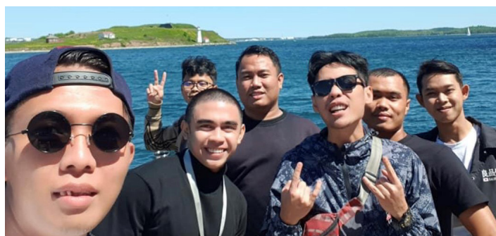
Mission to Seafarers Halifax, Canada