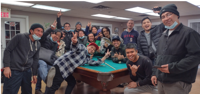
Augusta Unity Crew visits Mission Spring 2022 GRATEFUL