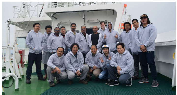
MV CMA CGM CHILE CREW