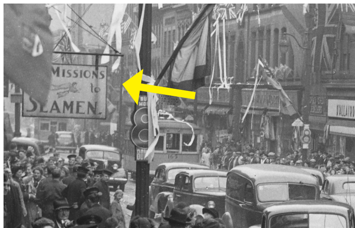
VE Day-Crowds gather on Barrington Street in Halifax to celebrate VE Day on May 8, 1945.