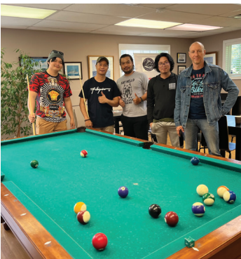
Crew of MV Contship Leo

The Captain and crew of the Iberian Bulker arrived Halifax from Norfolk, Virginia on October 8th to load wood pellets. Full crew of 20 Filipinos. Cargo operations were delayed due to cruise ships berthed nearby. We were fortunate to be able to host the crew through to October 16th. They enjoyed their stay in Halifax. The sawdust spray in the air was unbelievable!