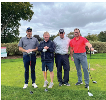
GFL Team – HOLE in ONE SPONSOR