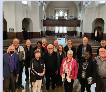
Delegates visit St. James Anglican Church