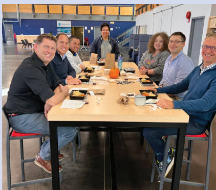
Oceansync Halifax team enjoying their Christmas Luncheon