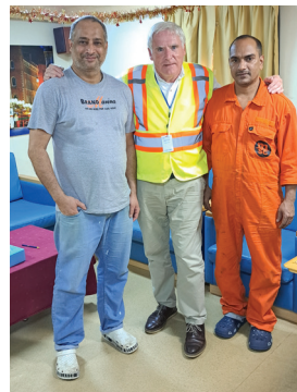
Long chat with the Master, and prayer time with two RC sailors on board.

The Captain and crew of the Iberian Bulker arrived Halifax from Norfolk, Virginia on October 8th to load wood pellets. Full crew of 20 Filipinos. Cargo operations were delayed due to cruise ships berthed nearby. We were fortunate to be able to host the crew through to October 16th. They enjoyed their stay in Halifax. The sawdust spray in the air was unbelievable!