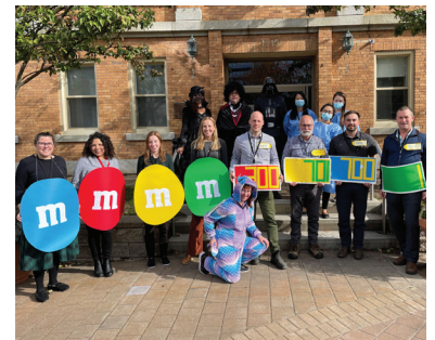
Happy halloween from Halifax Port Authority staff!

LIGHT AND HOPE TO SEAFARERS WHO KEEP OUR GLOBAL ECONOMY AFLOAT!