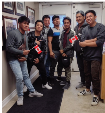
August Luna Crew