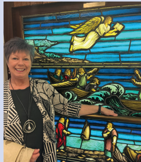
Beautiful window in Vancouver Mission