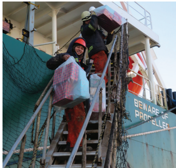
AUGUSTA SUN CREW