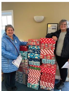
St. Francis of the Lakes