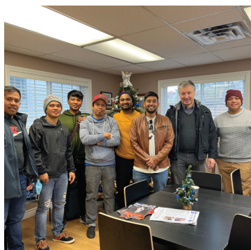
Maersk IDAHO -crew anchored in Basin for over one month