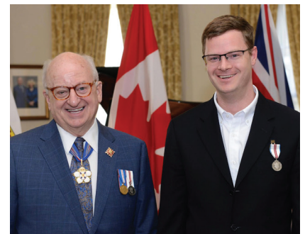
Office of the Lieutenant Governor of Nova Scotia