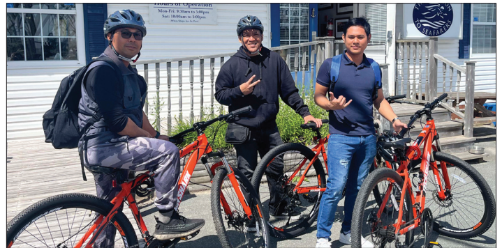
August Luna crew sight seeing with mission bicycles