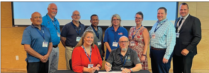
Namma board of directors-fantastic conference!

https://namma.org/resources/conference-2023/