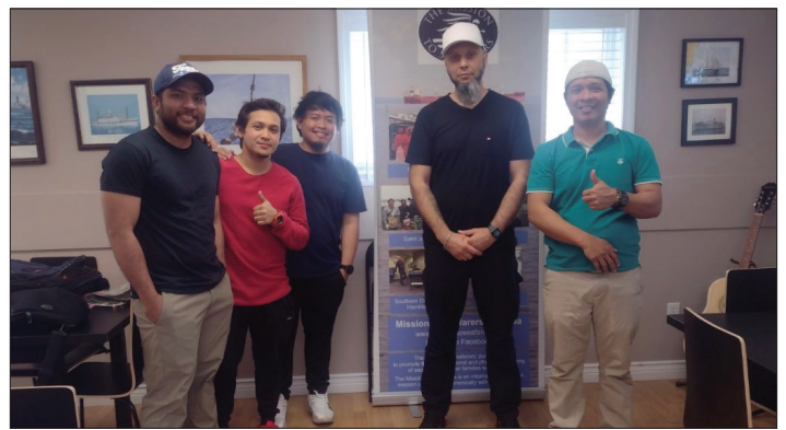
Contship Leo Crew rarely have time for respite.