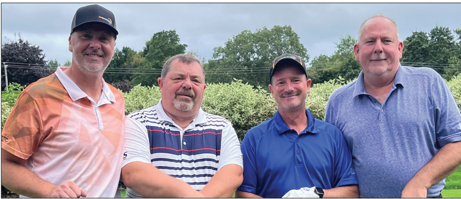
Thanks KMS for the many prizes & box of tee shirts for seafarers!