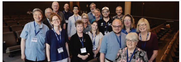
Mission to Seafarers delegates from all over the world