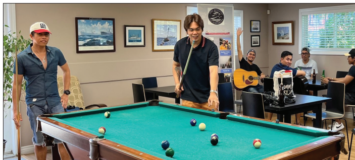
Captain and E M KEA crew enjoy billiards!