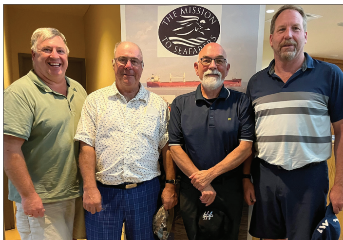
CIMARE donated Goat Ball winnings back to the mission $210!

LIGHT AND HOPE TO SEAFARERS WHO KEEP OUR GLOBAL ECONOMY AFLOAT!