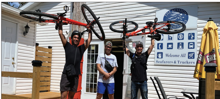
E M KEA crew rarely have shore leave! FEEL THE ENERGY!

ite place to visit – so our seafaring friends tell us. We are pleased to share with you, our donors and community partners, whose support is so critical to our ministry, that we now offer visiting seafarers the use of guitars, a beat box, bikes to explore the city free of charge and a basketball court is enjoyed often. OH, have you seen our new deck.... everyone is just.....WOW!!