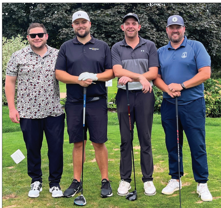
Welcome Rely On Nutec Canada – lowest scoring team