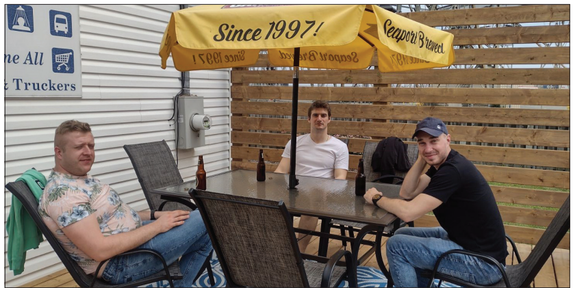
CMA CGM MADISON crew enjoying brewskies on our new deck !