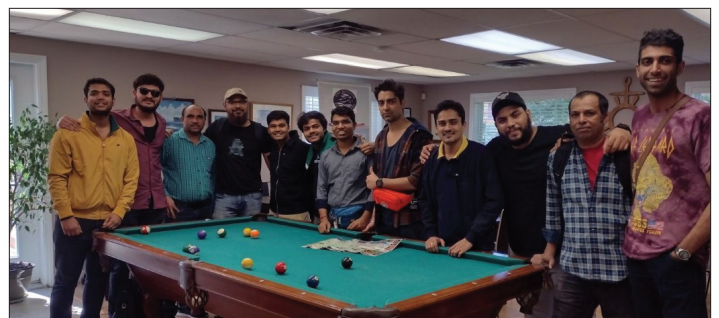
Crew of ONE EAGLE enjoy mission facilities

LIGHT AND HOPE TO SEAFARERS WHO KEEP OUR GLOBAL ECONOMY AFLOAT!