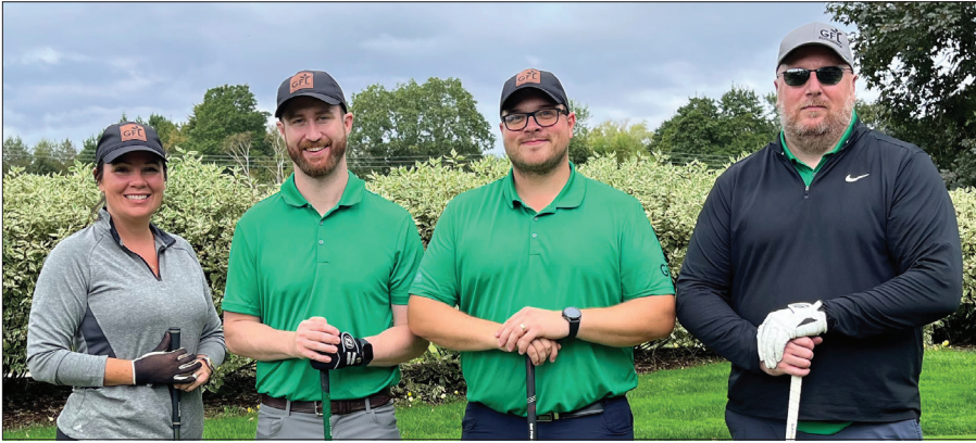
GFL Environmental inc. Hole in one sponsor