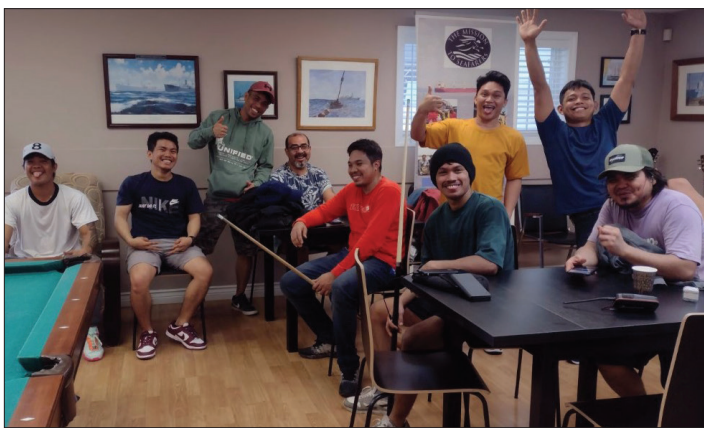
GOTLAND crew enjoying shore leave at Halifax and baseball