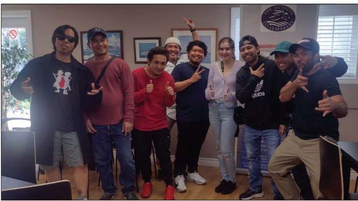
MV CONTSHIP LEO – first shore leave in a very long time!