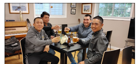
Vietnamese crew of Franbo Logic enjoying outside deck and brewskies in MtS Lounge.