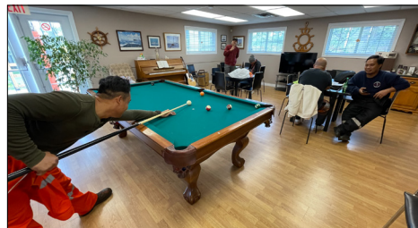
Gotland crew enjoying billiards and respite.

The International Day of the Seafarer is celebrated on June 25th, and dedicated to honouring the invaluable contributions of seafarers worldwide. Established by the International Maritime Organization (IMO) in 2011, this day serves as a poignant reminder of the critical role seafarers play in global trade and commerce. It's a time to recognize their sacrifices, resilience, and unwavering commitment to ensuring that goods and commodities reach their destinations across the seas. From navigating rough waters to enduring long periods away from home, seafarers embody courage and dedication. The International Day of the Seafarer encourages us all to reflect on their vital role and to advocate for their well-being, safety, and rights. It is a day to show appreciation and gratitude for these unsung heroes who connect nations and enrich our lives through their tireless