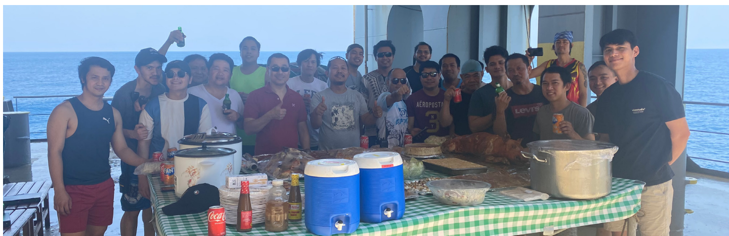
Crew of MOL Experience at Sea

Your ability to foster unity and collaboration among crew members is truly admirable. By promoting effective communication and teamwork, you create an environment where everyone feels empowered to contribute to the safety and success of maritime operation. Moreover, your embrace of technological advancements and innovative solutions demonstrates your proactive approach to enhancing safety standards onboard. Your utilization of cutting-edge tools and systems not only improves efficiency but also reinforces a culture of safety that is deeply ingrained in the Filipino seafaring tradition. In essence, your tireless efforts and unwavering dedication make you the unsung heroes of the maritime industry. Your contributions do not go unnoticed, and I am sincerely