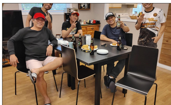
Vega Vela Crew enjoying respite