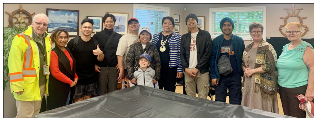
Gotland crew visited on the Day of the Seafarer. We were pleased to share with them MtS lanyards, Canada pins provided by our Mission friend MP Andy Fillmore, treats and camaraderie.

LIGHT AND HOPE TO SEAFARERS WHO KEEP OUR GLOBAL ECONOMY AFLOAT!