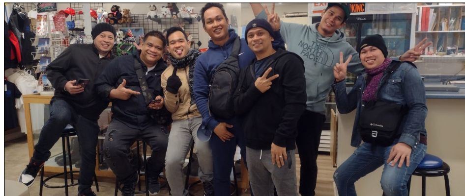
CME CGM J. MADISON crew members enjoy respite at Halifax