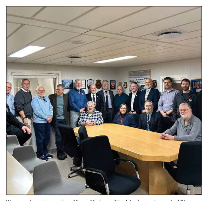
We were pleased to see these Master Mariners of the Atlantic together on the MV ASTERIX. These esteemed captains have been generous supporters within the Port of Halifax. We have so much to be grateful for. BZ!