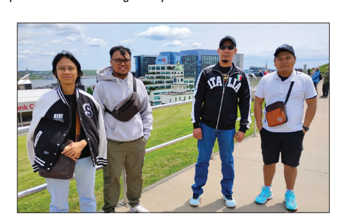
CMA CGM J ADAMS at Citadel Hill