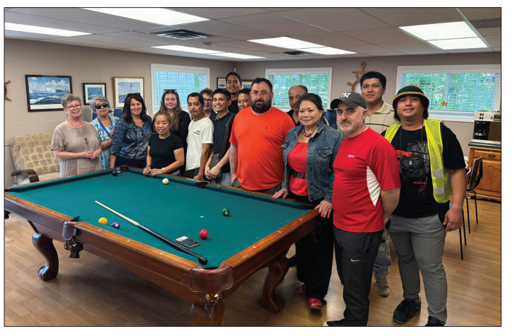
The International Day of the Seafarer