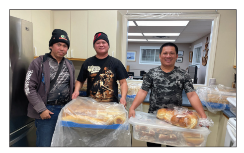
ONEGO GLOMMA helps with Cobs delivery