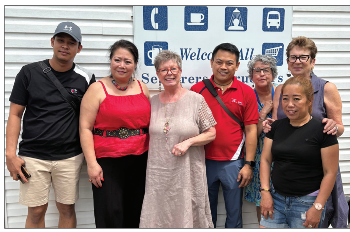
Lunch on the deck