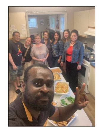
We are truly blessed!