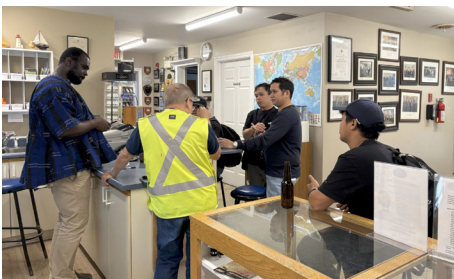
After a week on anchorage at the Bedford Basin to avoid Hurricane Erin, the Captain and crew of the Tropic Hope take time off the ship and rest at the Mission before sailing to the U.S. and the Caribbean. The vessel is a regular visiting Halifax every two weeks.