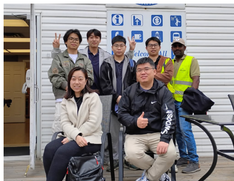
APL SENTOSA CREW