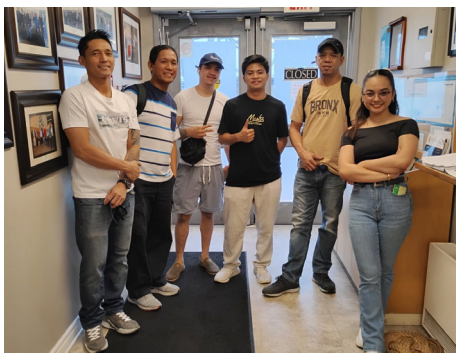
APL ESPLANADE CREW