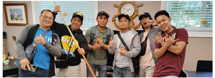
Crew members from MV LARS D hamming it up in the Mission during shore leave while the ship was in the Port of Halifax. The importance of shore leave can be measured by the smiles on their faces!!

Remember almost everything we touch, our clothes, our phones, our food, has crossed the oceans to reach us. Behind those journeys are seafarers... invisible lifelines of global trade, spending months away from home, often in isolation, facing storms, exhaustion, and uncertainty. We provide a sanctuary of warmth, laughter, connection, a place to find rest, respite and dignity. Please support us with a monetary donation and/or provide gently used clothing for our Free Room. Blessings in abundance to all.