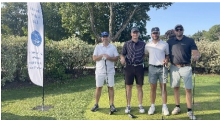
Bluewater Group – Lowest Scoring Team