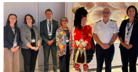
Seven Seas Splendor