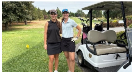
Ship Happens – Most Honest Team