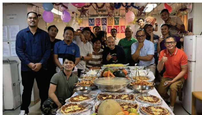
MSC NISHAV "Gifts of time, laughter, and love are the best kind of fullness. Thanks for sharing yours with us MtS Halifax. Thank you! Merry Christmas and Happy New Year!"

MAY THE WINDS OF PEACE GUIDE OUR JOURNEYS, AND MAY EVERY WAVE BRING US CLOSER TO UNDERSTANDING AND COMPASSION. LET US STAND UNITED IN HOPE AND LOVE. TOGETHER LET'S SPREAD HOPE AND PEACE.