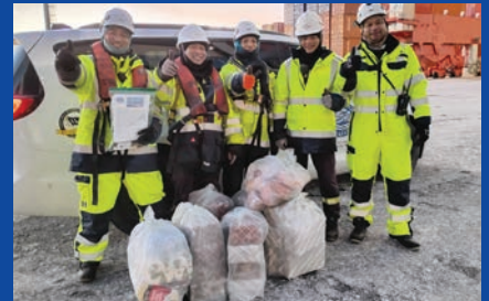
CMA CGM INNOVATION