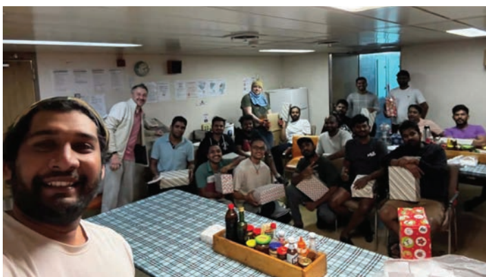
MV Felixstowe , heading to USA "we received your good gifts for the Christmas. It was a great surprise for us. Thank you everybody involved"