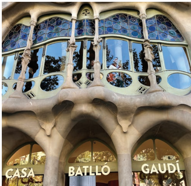
CASA BATLLÓ GAUDI