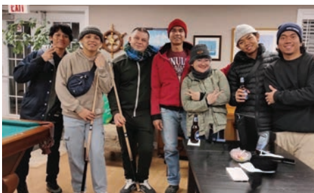
Crew of CMA CGM TITAN had a good rest with recreation at the Mission after a month-long journey from Sri Lanka.